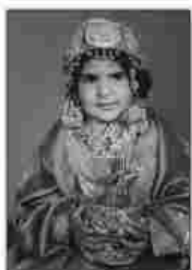
A Kashmiri girl

To be effective, the ideas of inclusive nationalism had to be built into the Constitution. For, as already discussed (in section 6.1), there is a very strong tendency for the dominant group to assume that their culture, language or religion is synonymous with the nation state. However, for a strong and democratic nation, special constitutional provisions are required to ensure the rights of all groups and those of minority groups in particular. A brief discussion on the definition of minorities will enable us to appreciate the importance of safeguarding minority rights for a strong, united and democratic nation.