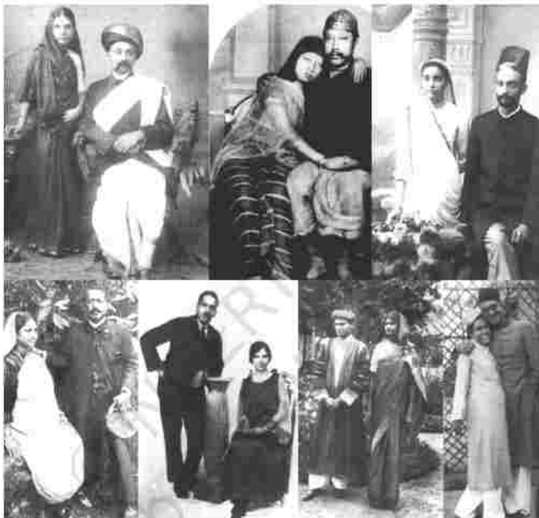
Couples from different regions 1880s to 1930s: Clockwise from top left corner: Gujarat, Tripura, Bombay, Aligarh, Hyderabad, Goa, Calcutta. From Malavika Karlekár, Visualising Indian Women 1875–1947 , Oxford University Press, New Delhi.

Note: In this chapter, the word "State" has a capital S when it is used to denote the federal units within the Indian nation-state; the lower case 'state' is used for the broader conceptual category.