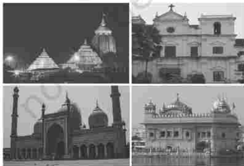
Images of different religious places

In everyday language, the word ' communalism ' refers to aggressive chauvinism based on religious identity. Chauvinism itself is an attitude that sees one's own group as the only legitimate or worthy group, with other groups being seen – by definition – as inferior, illegitimate and opposed. Thus, to simplify further, communalism is an aggressive political ideology linked to religion. This is a peculiarly Indian, or perhaps South Asian, meaning that is different from the sense of the ordinary English word. In the English language, "communal" means something related to a community or collectivity as different from an individual. The English meaning is neutral, whereas the South Asian meaning is strongly charged. The charge may be seen as positive – if one is sympathetic to communalism – or negative, if one is opposed to it.